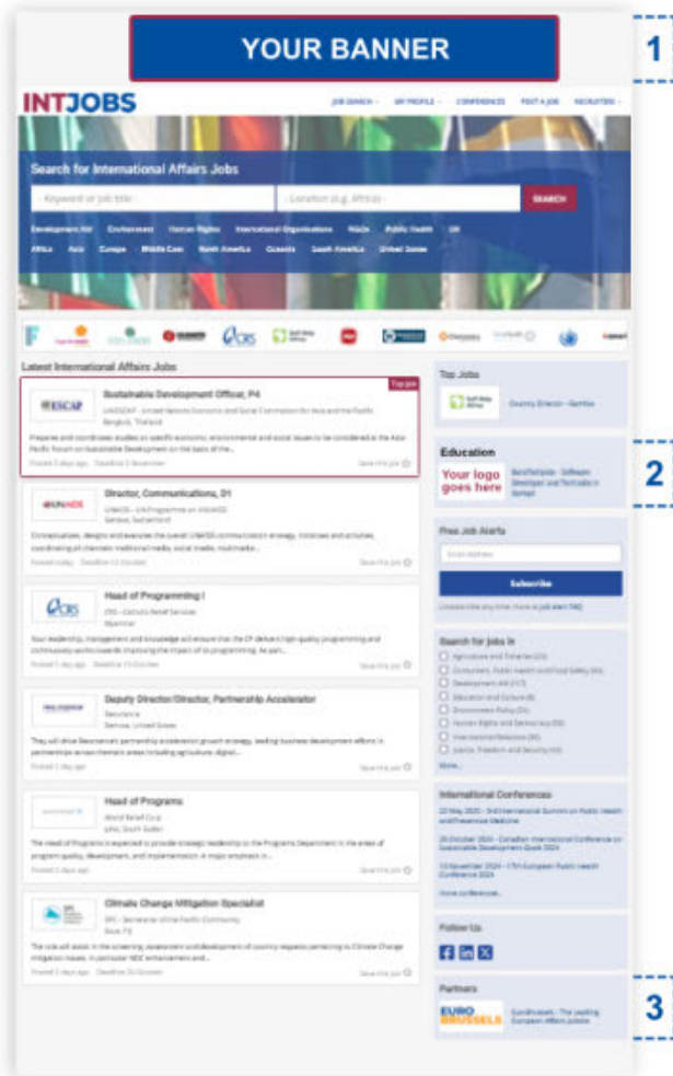
1. Leader board Banner / 2. Education and Courses/MBA Box 3. Partner Profiles